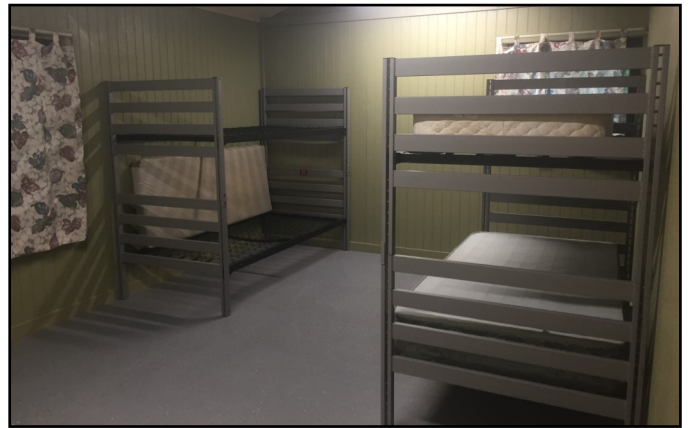
Kolthoff Sleeping Area