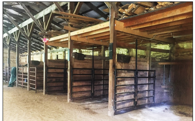
Stalls at the Indoor Riding Arena