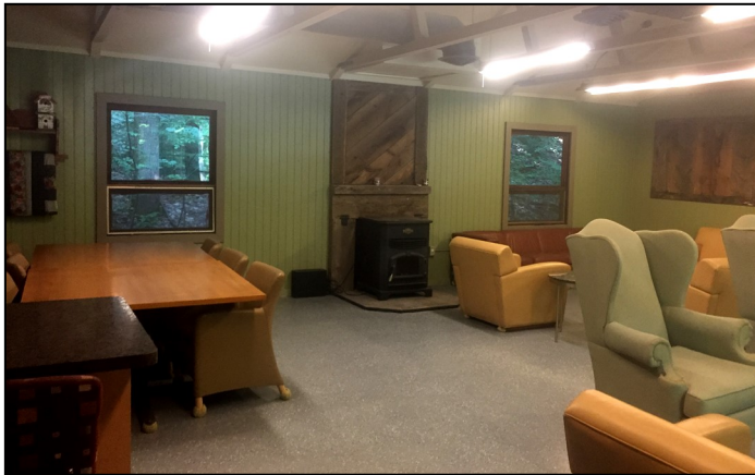
Kolthoff Community Area