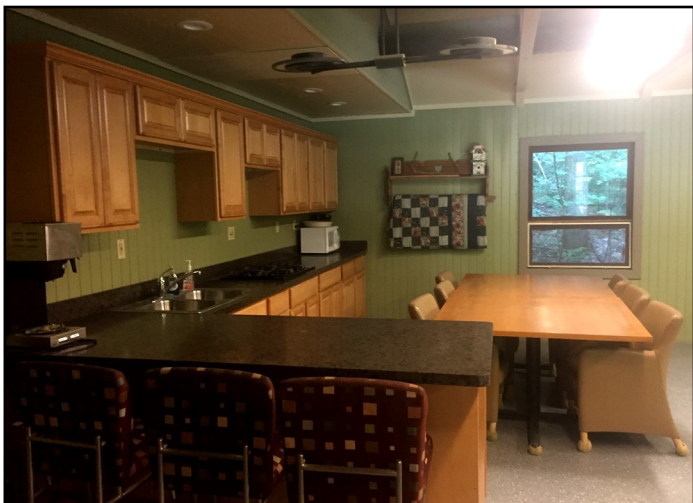
Kolthoff Kitchen Area