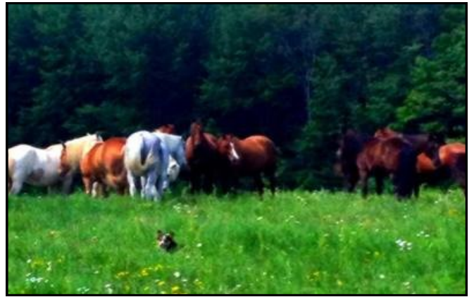
Horses, horses, and more horses